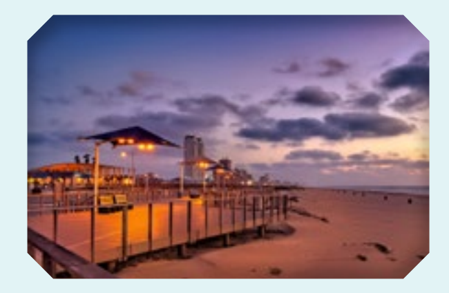
June 7-8, 2024 A New Wave: TADC Young Lawyer Seminar Margaritaville Hotel, South Padre Island, Texas